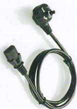
220V/110V电源线 220V/110V power cable