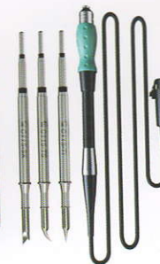
C T115手柄+焊笔 T115 handle + soldering pencil

备注: A、B、C可自由选择 Note: You can choose A、B、C freely