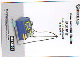
使用说明书 Instruction Manual