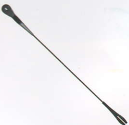
线缆支撑杆 Cable support rod