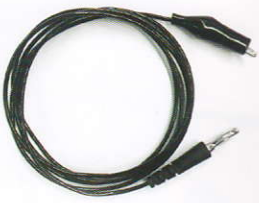
接地线 Earth cable

备注: A、B、C可自由选择 Note: You can choose A、B、C freely