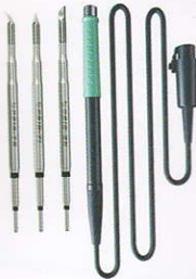
A T210手柄+焊笔 T210 handle + soldering pencil