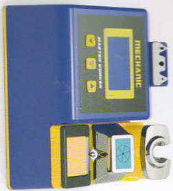
MA-SD01 纳米焊台 MA-SD01 Nano Soldering Station