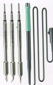
B T245手柄+焊笔 T245 handle + soldering pencil